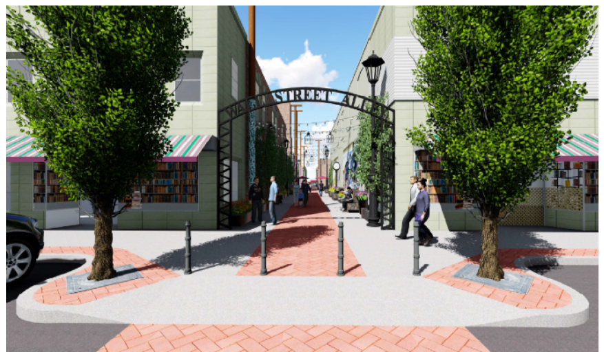
WALL STREET ALLEY EXTENSION CONCEPT PLAN OPTION B